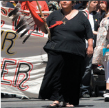
Protestors march through downtown Toronto as part of the Aboriginal Day of Action on Thursday, May 29, 2008.

"In Ottawa, there are a lot of people who live in poverty also, so I think (the Day of Action) is a great thing to do for aboriginal people."