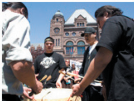
Protestors play the drum outside Queen's Park as part of the Aboriginal Day of Action on Thursday, May 29, 2008.