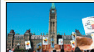
First Nations march on Parliament Hill as part of the National Day of Action. ↻